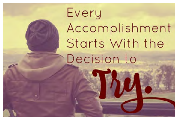
Illustration 11:

NOTE: Students who are enrolled at Houghton Lake Institute of Cosmetology are NOT considered to be enrolled at Cadillac Institute of Cosmetology and visa versa. If a student wishes to change which college they are enrolled in they must refer to the TRANSFER STUDENTS - CREDIT FOR PREVIOUS TRAINING section in this catalog.