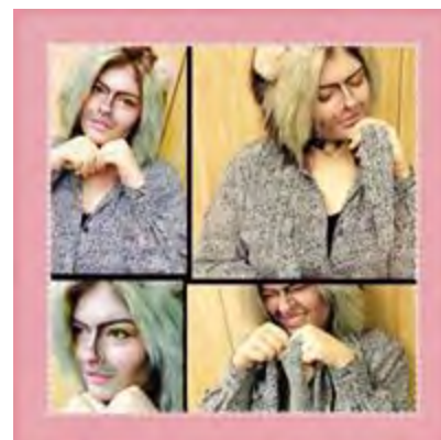
Illustration 6: Hair, Makeup & Photo by Briana Worthington