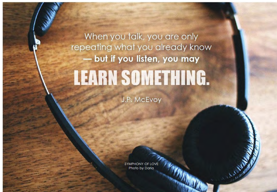
Illustration 10: http://born4apurpose.com/blog/i-want-talk/