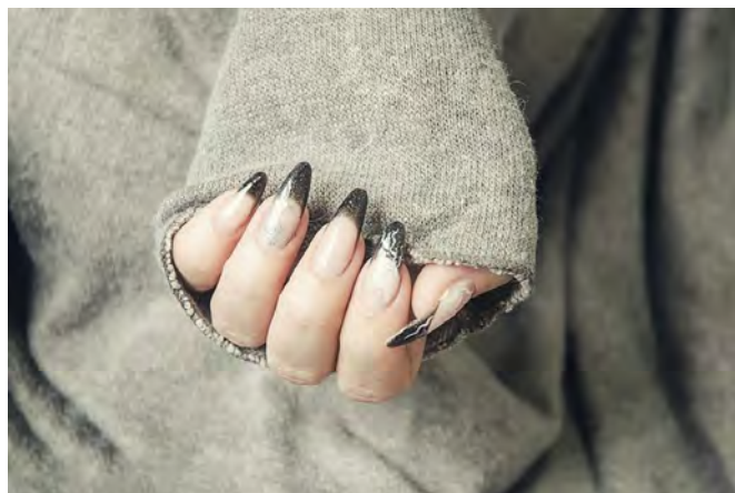
Illustration 8:

*Students are required to have completed all required tests, assignments, and MPAs along with their Portfolio and have their account balance paid in full when they are 100 clock-hours away from graduating. These graduation requirements are mandatory prior to a student beginning their final preparations and exams. Students are responsible for monitoring their own progress as to not miss this important deadline.