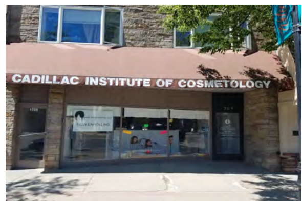
Illustration 2: Cadillac Institute of Cosmetology - Branch Campus