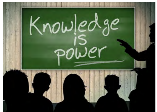
Illustration 14: https://pixabay.com/en/adult-education-leave-know-power-379219/