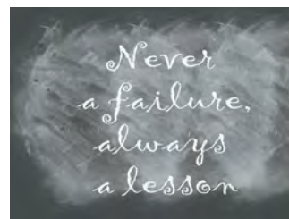
Illustration 15: