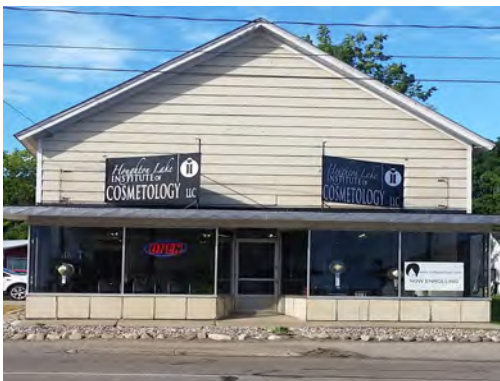
Illustration 1: Houghton Lake Institute of Cosmetology - Main Campus

You may compare these institutions with others by using the College Navigator tool provided by the National Center for Education Statistics at https://nces.ed.gov/ .